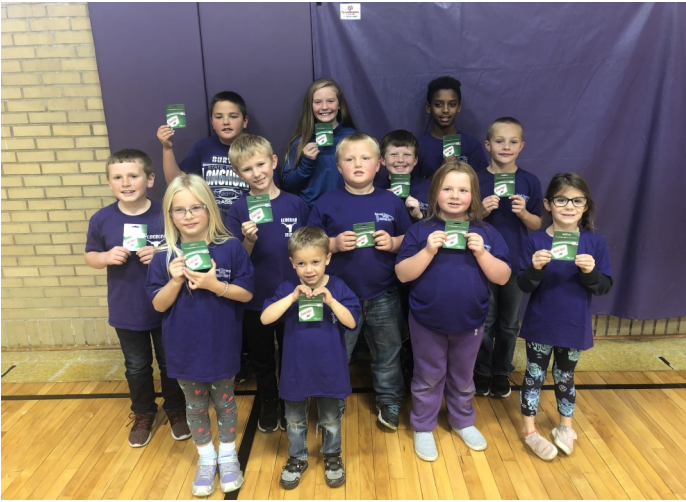
October Longhorn Pride Winners: