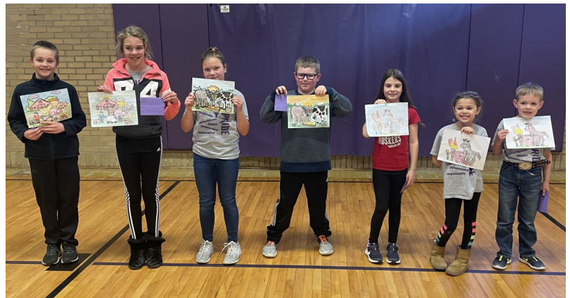
Coloring Contest Winners pictured above from left to right