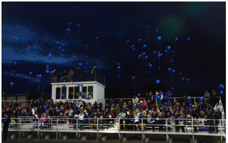
Blue Ribbon Balloon launch at the first Longhorn touch down against the Clearwater/Orchard Cyclones.