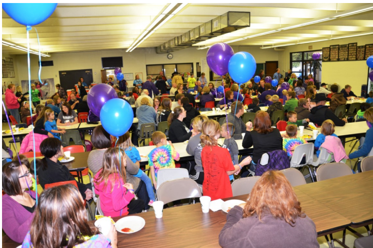
Blue Ribbon Tail Gate party before the football game against Clearwater/Orchard.