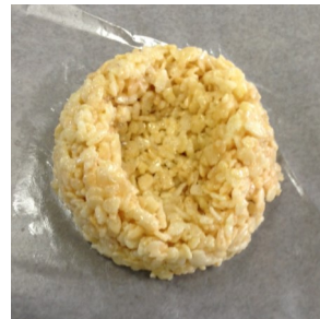
Nests made for snack time