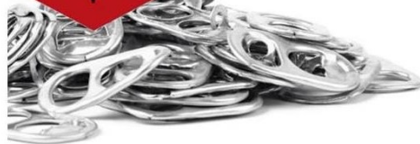
Many Hearts. One Home.

The Burwell 5th Grade has started to collect aluminum pop tabs for the Ronald McDonald House. Those tabs, when recycled, help cover some of their operational costs. Thanks to schools, businesses, community organizations, and families, they have recycled approximately 35 million pop tabs last year. The money from those donations paid for their electric bill each month. You can bring your pop tabs to the Burwell Elementary office.